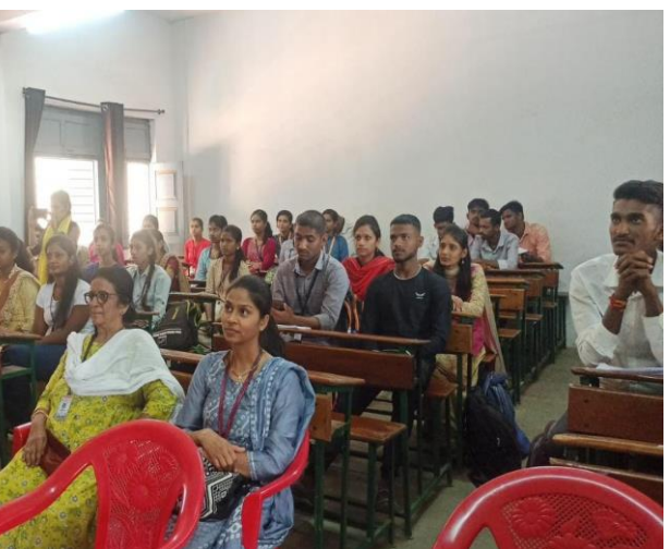
Students participation in workshop